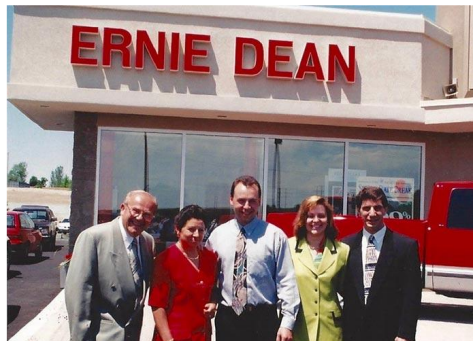
June 1997, the Dean family at the grand opening of the dealership's second location