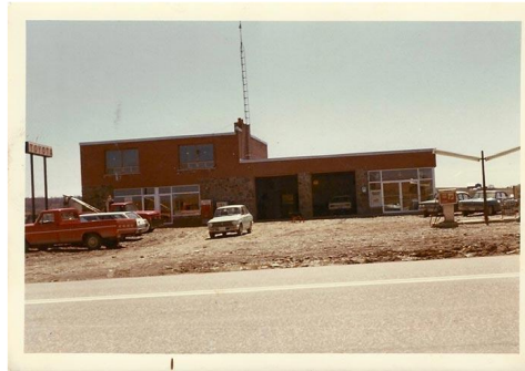
This is where it all started, here at 7635 Highway 89, Alliston Toyota opened its doors in 1969

In a time of big dealer groups and using flashy gimmicks to sell cars, the staff at Ernie Dean believes in keeping an eye on the future while embracing the values of the past.