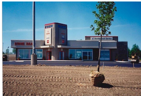
Almost there, our second location ready for move in, May 1997